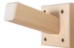
603022 Single Towel Hook (White Cedar)