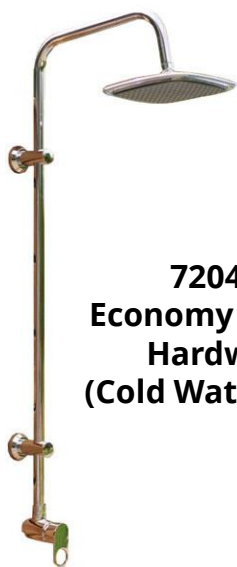
720404 Economy Shower Hardware (Cold Water Only)