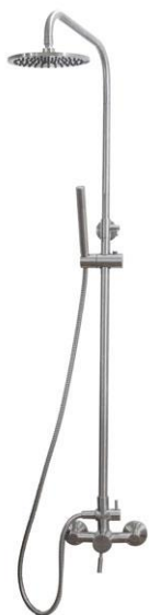
720405 Premium Shower Hardware